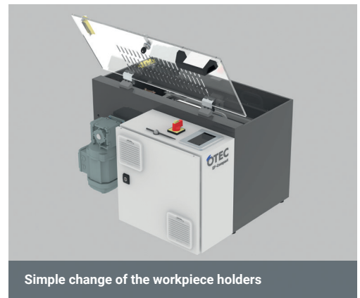
Simple change of the workpiece holders

The new EF-Compact table-top machine gently smooths and polishes delicate pieces of jewellery with complex geometries. Machine processing minimise manual tasks. The OTEC EF-Compact combines high gloss polishing with maximum cost-effectiveness.