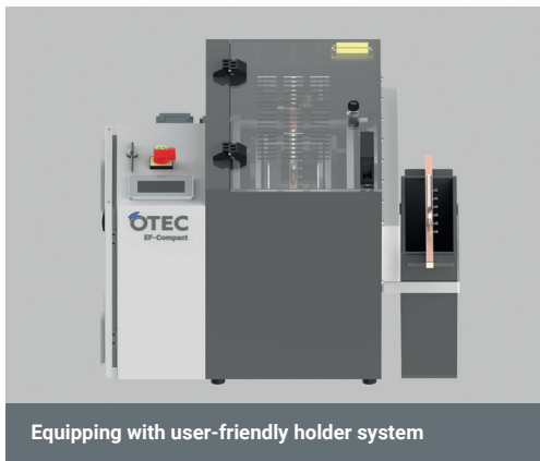
Equipping with user-friendly holder system