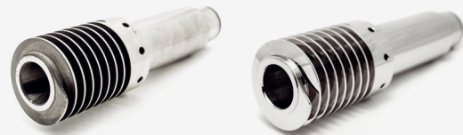
Extruder screw (stainless steel)