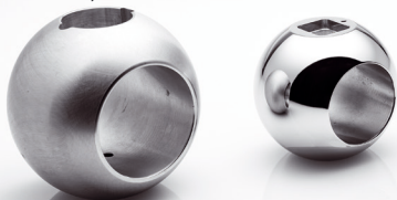
Valve balls (stainless steel)