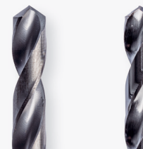
Cutting tool coatings (TiAlN*)