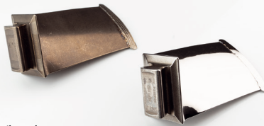
Turbine blades (titanium*)