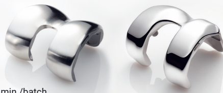
Knee joint (cobalt chromium)