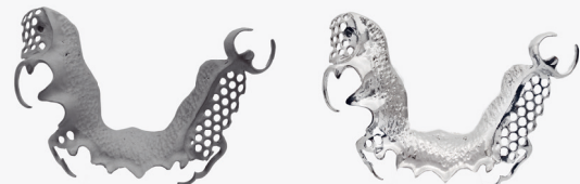
Denture clasps (cobalt chromium)